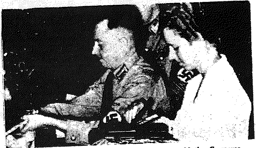
Every year on Hitler's mother's birthday the German Mother Cross was awarded to women who had produced large broods." A ceremony in Berlin.

What happened to the women of Germany under the Nazis is an example of what fascism does to all exploited social groups. The Nazis smashed a strong and vital women's movement in Germany. They crushed it just like they crushed the trade unions and political parties of the workers' movement as a whole. After that people who might have wanted to resist found it almost impossible to do so. Once people are isolated from one another and have no organised way to fight for what they want, it is very difficult for them to oppose the fascist's police regime — the state really appears to be all powerful.