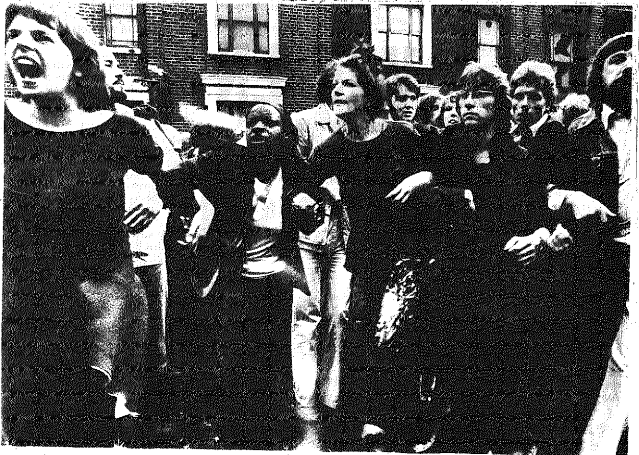
New Cross Rd. Anti-racists.

The white women in our group also feel the need to challenge and understand their own racism and we are organising a consciousness raising group to discuss this and educate ourselves. By understanding the roots of our own racism we can more easily combat it in other people.